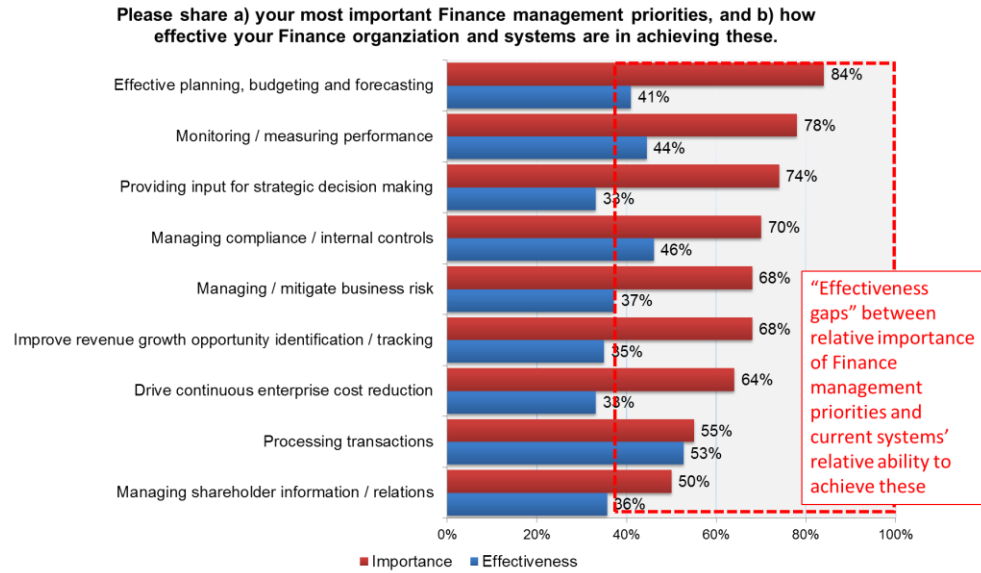
Figure 1: The Finance “Effectiveness Gap” Model